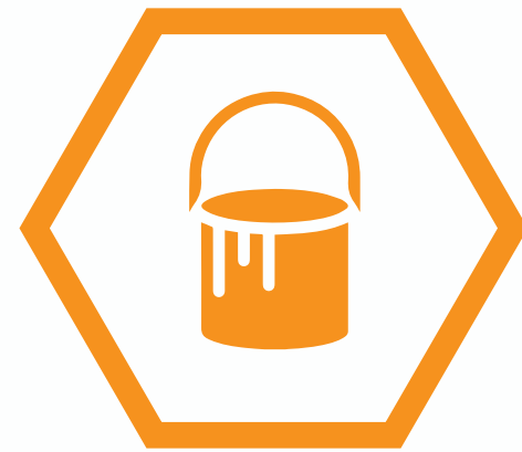
Paints & Specialty Coatings