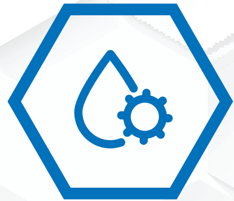
Oil and Gas

Aegex Technologies is proud to offer its 2nd Generation intrinsically safe tablet , the Aegex100M with faster wireless services, enhanced memory, and expanded storage. Operating in the most hazardous industries with explosive environments, Aegex solutions bring real-time connectivity to help organizations harness the power of data to optimize efficiency.