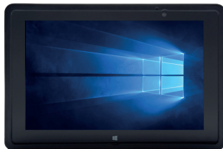
The Aegex10 IS Tablet

The 10.1-inch Windows-based tablet is rated IP65 rugged for industrial use, yet is lightweight and priced as low as non-certified devices. Its Windows 10 operating system gives users uniform access to the Microsoft cloud, plus apps and services, including custom-designed software like AVEVA applications.